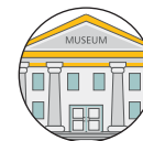
Museums & Galleries