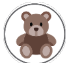
Toys, Games, & Stuffed Animals