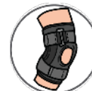
Physical Therapy Devices