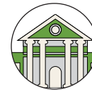
Colleges & Universities