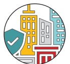
Public Safety & Military