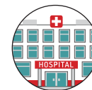
Healthcare & Assisted Living