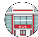
Child Care & Schools