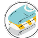
Cloths, Apparel & Uniforms